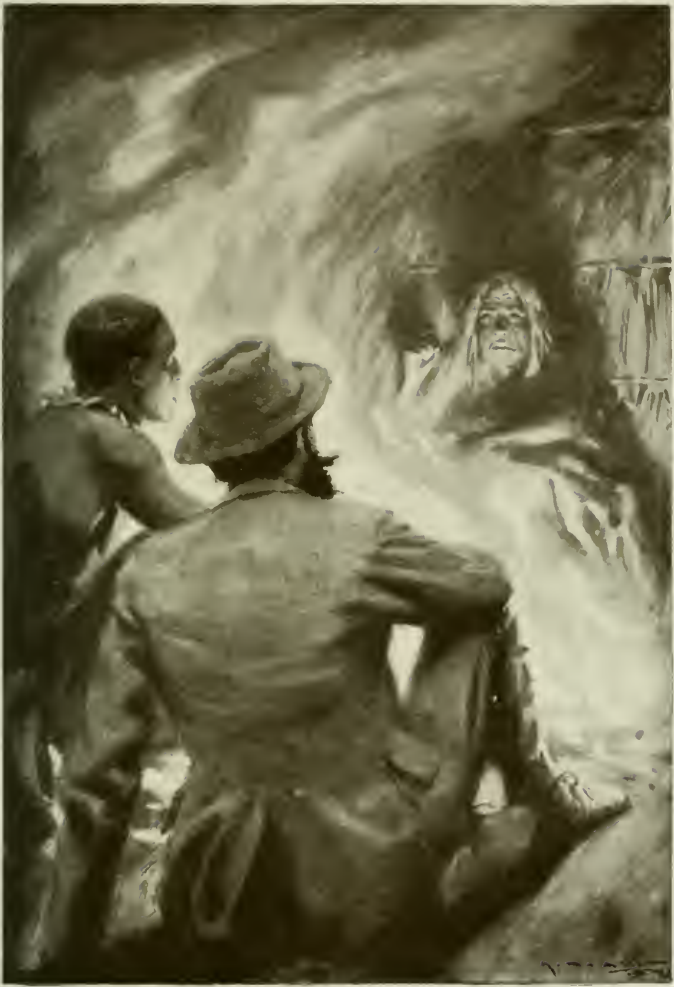
“‘Into this stone I am about to draw your spirit, O Macumazana’” (see page 33).