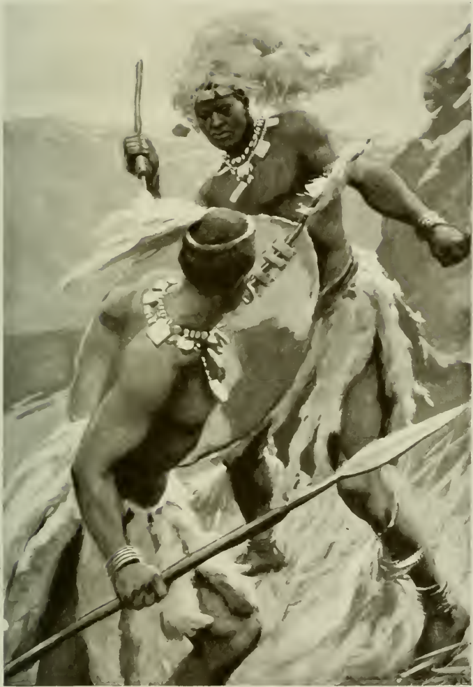
"Saduko and Umbelazi were fighting there" (see page 282).